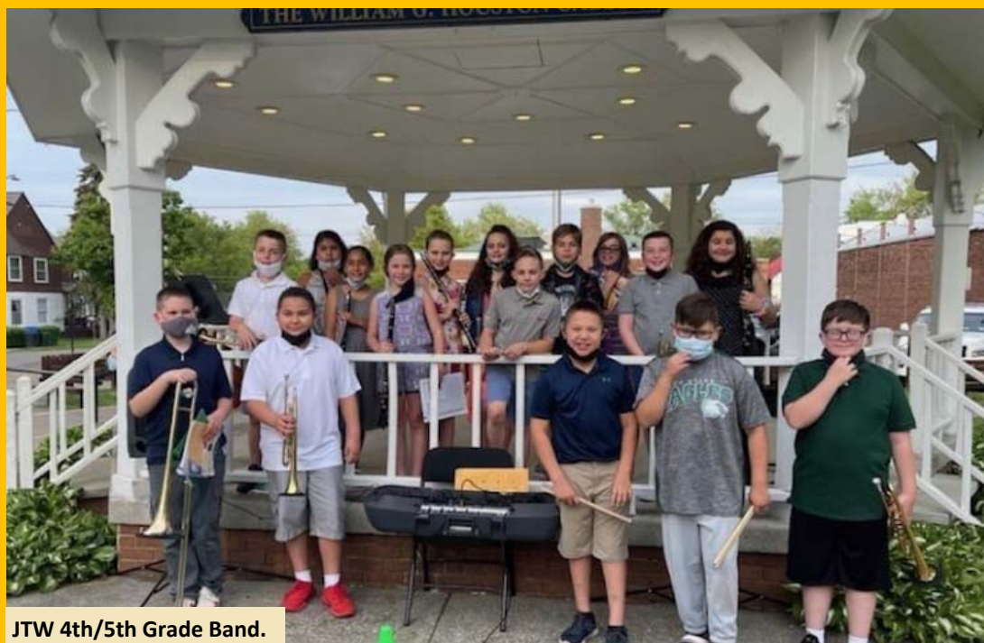
JTW 4th/5th Grade Band.