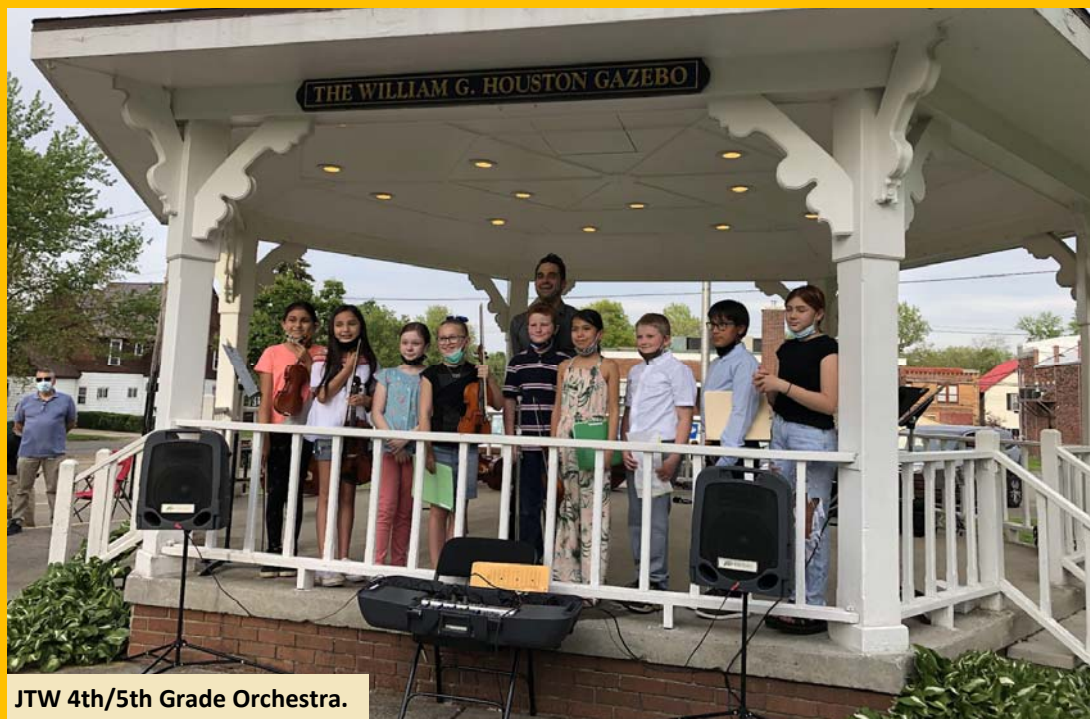
JTW 4th/5th Grade Orchestra.

Thurs., June 24 6:30 pm, HS graduation, football field. Rain date: Friday, June 25.